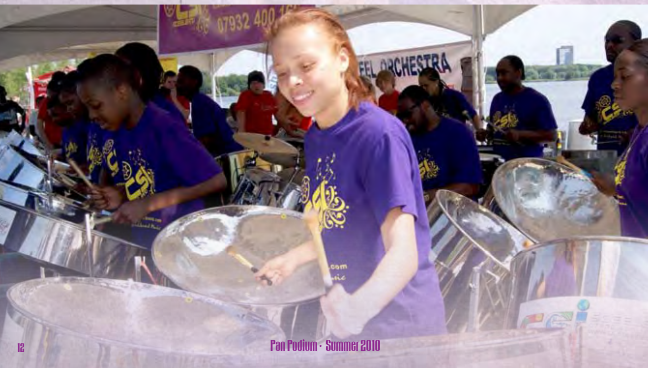
Pan Podium - Summer 2010