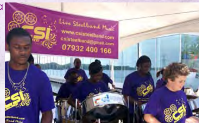
Pan Podium - Summer 2010

Afrique-Carib would like to thank everyone who contributed to the success of their sixth annual festival especially the musicians, artists, DJs and dancers.